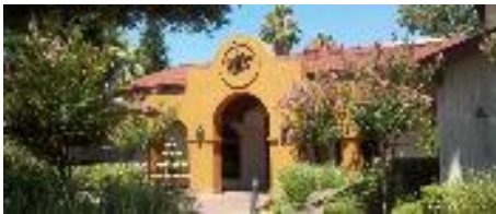
Old Spaghetti Factory